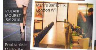
ROLAND MOURET S/S 2010